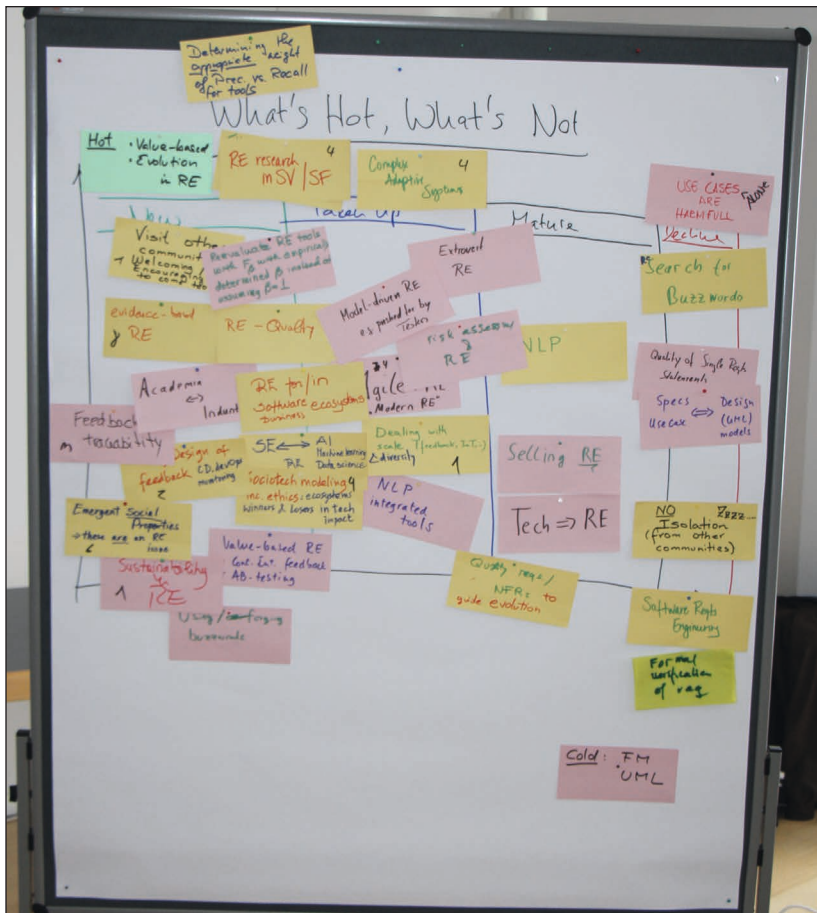
FIGURE 2. At the end of What's Hot, What's Not, the two left columns on the game chart, covering the newest research topics and those that have been taken up and are actively being worked on, were blanketed in notes.

the newest research topics and those that have been taken up and are actively being worked on, were blanketed in notes (see Figure 2). The newest areas included emergent social properties, sustainability in RE, and the interrelationship and collaboration between academe and industry.