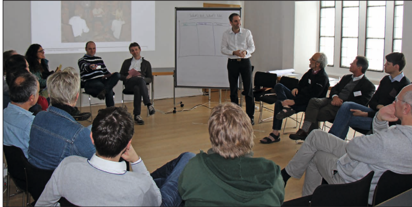
FIGURE 1. In an energetic game of What's Hot, What's Not, the participants opined and argued good-naturedly about requirements engineering.